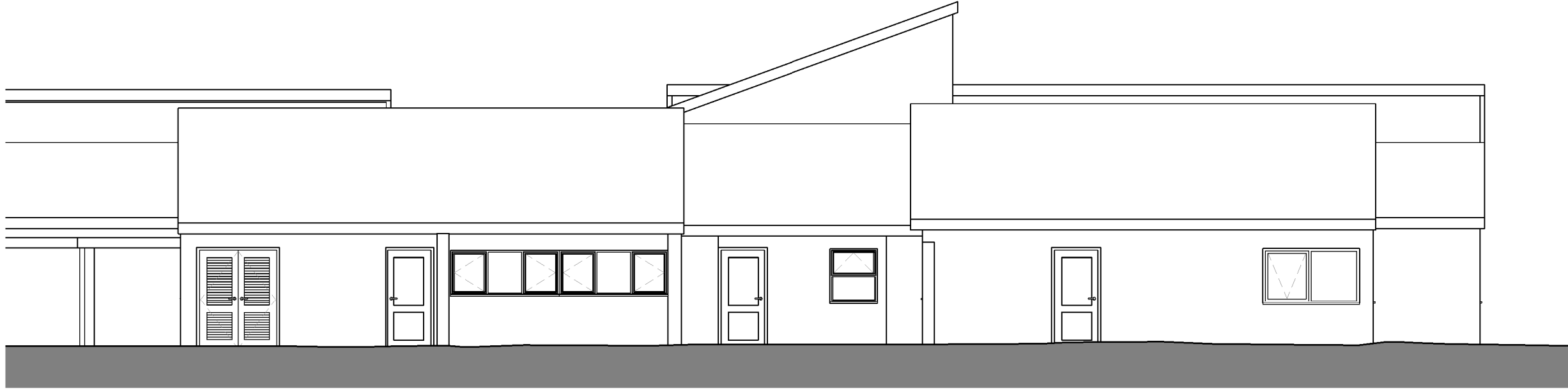
3 Existing Elevation_West 1 : 100